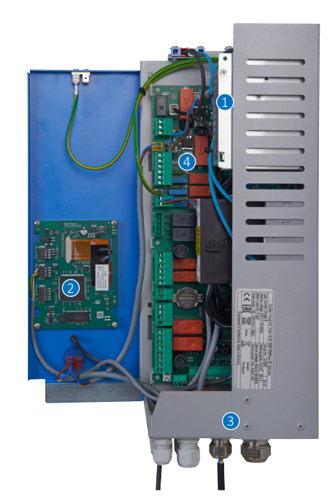
Power supply [1] Control board [2] Powder coated housing [3] Spa Control [4]